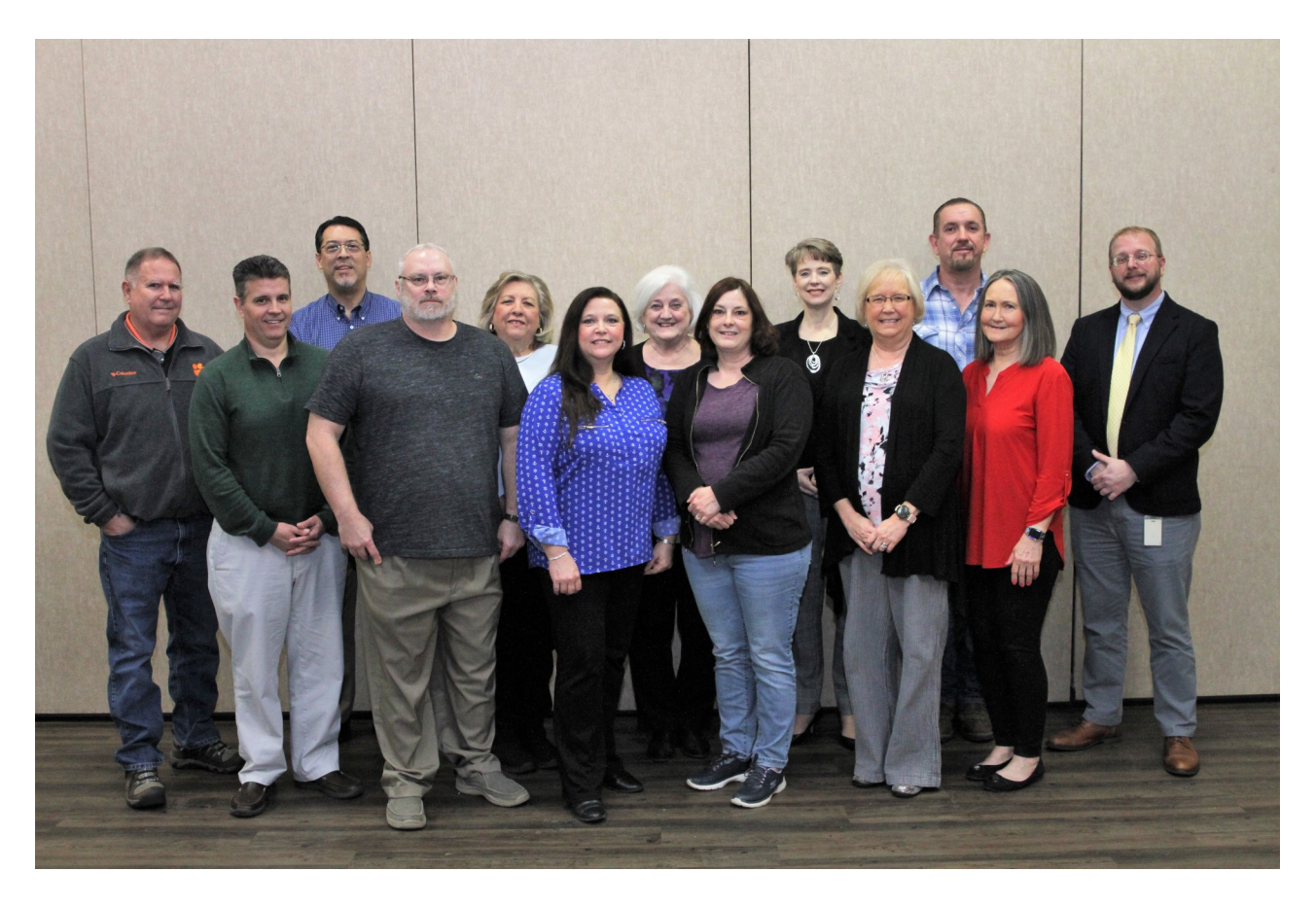
2023 SCAAO Board of Directors